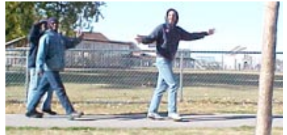
Eleven walkers joined the CROP Walk, having raised over $111.00 from inmates at the North Central Correctional Facility. More photos of both walks on page three.