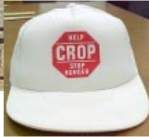
Pastor Lang's cap