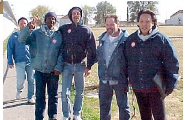
Ardent walkers slowed only long enough to snap this picture. They all went the whole 18 laps (6 miles).