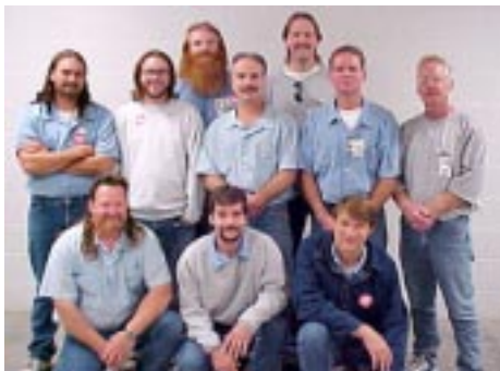
The Fort Dodge Inside Church Council