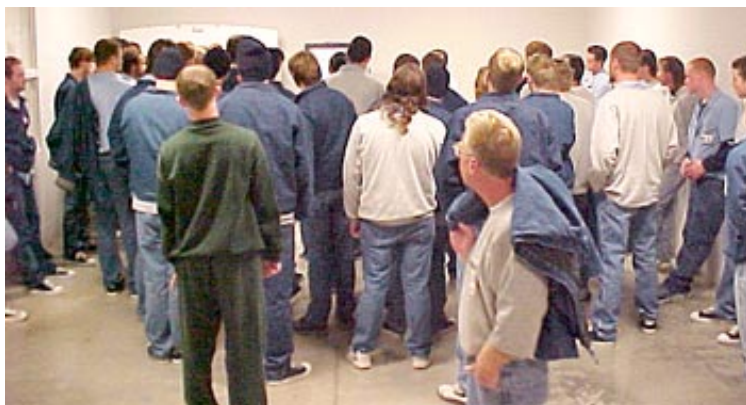
Before the walk on October 17, CROP Walkers in Fort Dodge viewed the video about the miracle tree used by third world people for food and health products.