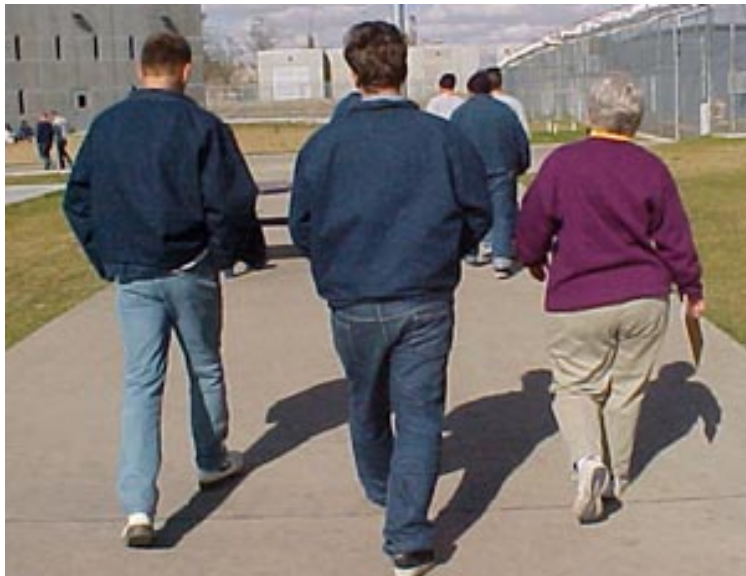
Some of the walkers in Fort Dodge were hard to keep up with.