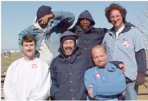
Walkers at NCCF, Rockwell City, posed for a picture before they started their walk on October 16, 1999