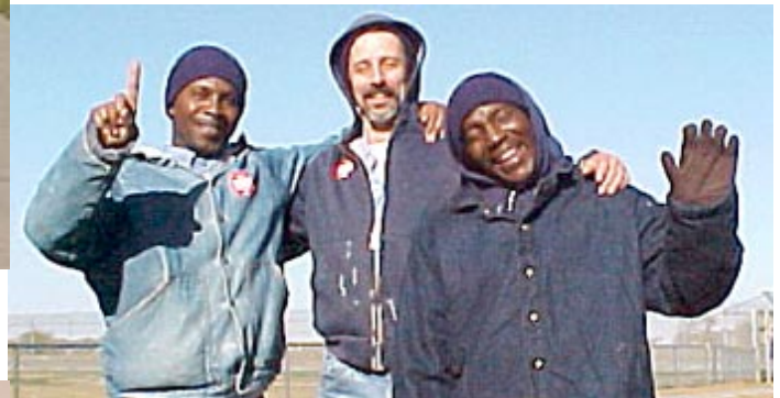
Even though the weather was a bit cool, spirits remained high in the Rockwell City CROP Walk.