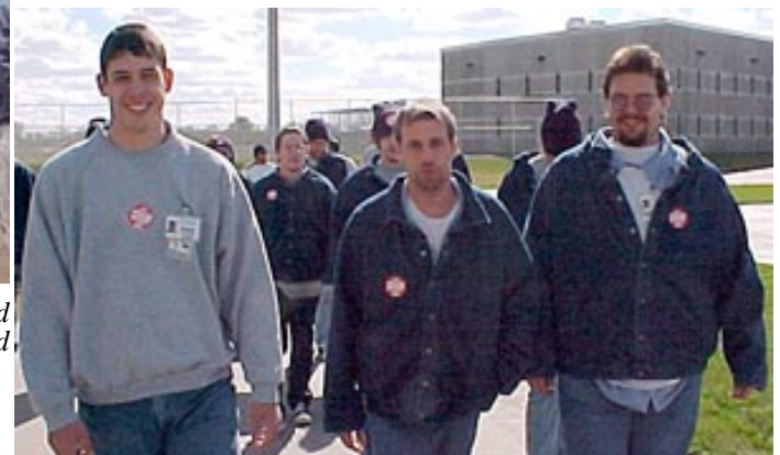
Good fellowship, a good cause, lots of smiles over the miles.