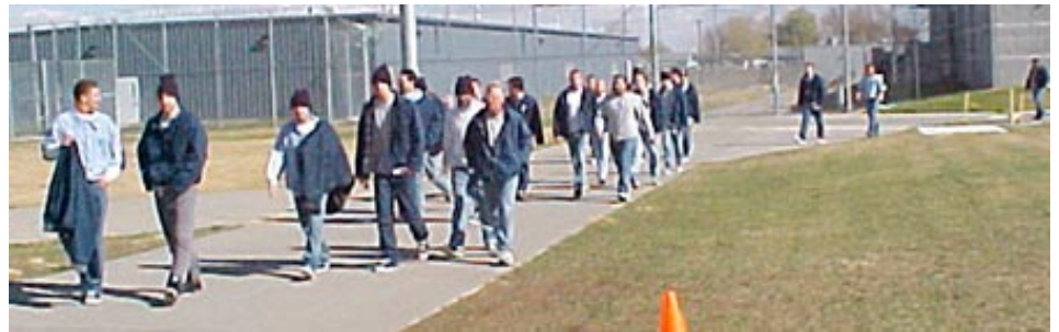
Inmates at the Fort Dodge Correctional Facility turned out in large numbers for the October 17, 1999 CROP Walk sponsored by The Church of the Damascus Road and Church World Service. 123 walkers turned out this year.